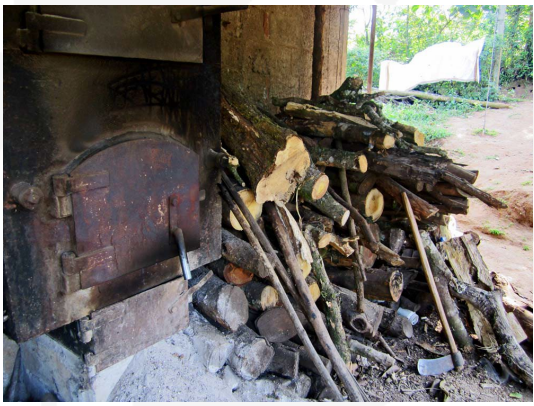
<u>This Photo</u> by Unknown Author is licensed under <u>CC BY</u>